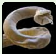
Electron micrograph of an adult lungworm

This is a problem for dog owners since dogs may unwittingly swallow infected snails and slugs (or their slime trails) whilst exploring parks and gardens. Once swallowed, the larvae migrate to the heart where they will develop into adult worms.