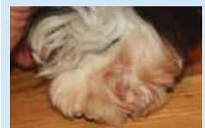
Paw chewing in a dog: Discoloured hair is a sign of excessive grooming.

Inhaled allergies are common at this time of year – during the spring and summer months a surge in pollen levels can lead to seasonal allergies in humans and pets alike. However the symptoms are often very different; whilst humans get 'hay fever' and sneeze, affected pets tend to show skin symptoms – becoming itchy . Dogs may show generalised itchiness, but more commonly may show localised signs of paw chewing, face rubbing and itchy ears (leading to recurrent ear infections).